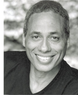
ADRIAN TYNDALE MOREG LIMITED P O Box 38032, Wimbledon, LONDON SW19 4YB ENGLAND