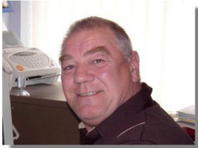
RALPH WINSTANLEY MOREG LIMITED

28 Darley Road, Hawkleyhall, Wigan WN3 5PG ENGLAND