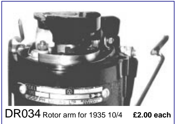
DR034 Rotor arm for 1935 10/4 £2.00 each

CI006 for six-volt £18.00each CI012 for twelve-volt £18.00each